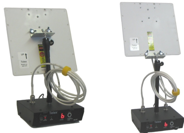
Figure 1 XO-AP and Panel Antenna